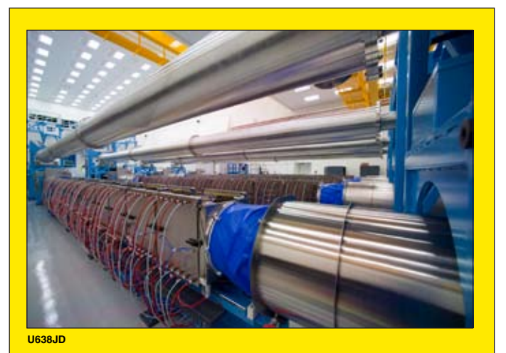
Figure 2. Activation of the four-beam OMEGA EP system is currently underway. The photograph shows the power amplifier portion of the system with a view toward the target chamber area.